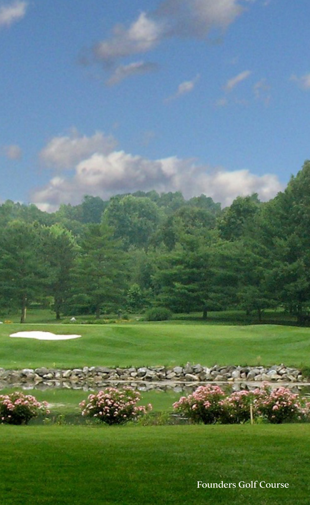
Founders Golf Course