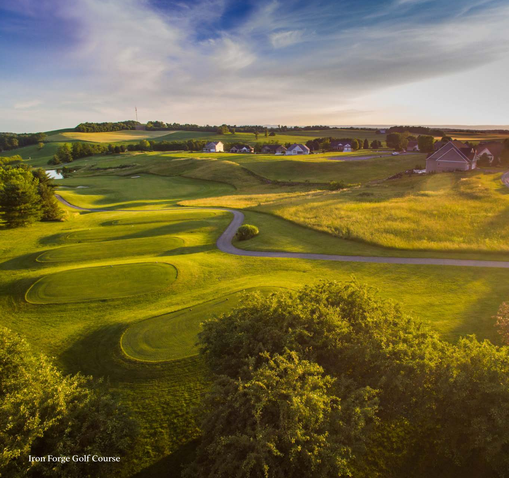
Iron Forge Golf Course